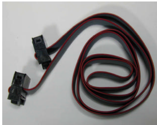
Fig 2.2 Ribbon cable