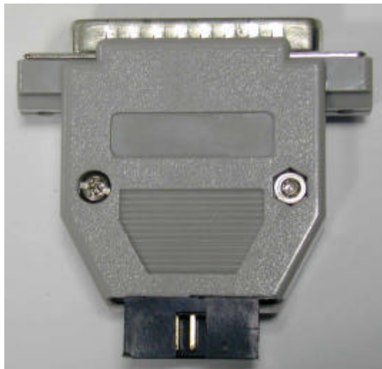
Fig 2.1 Downloading Adapter